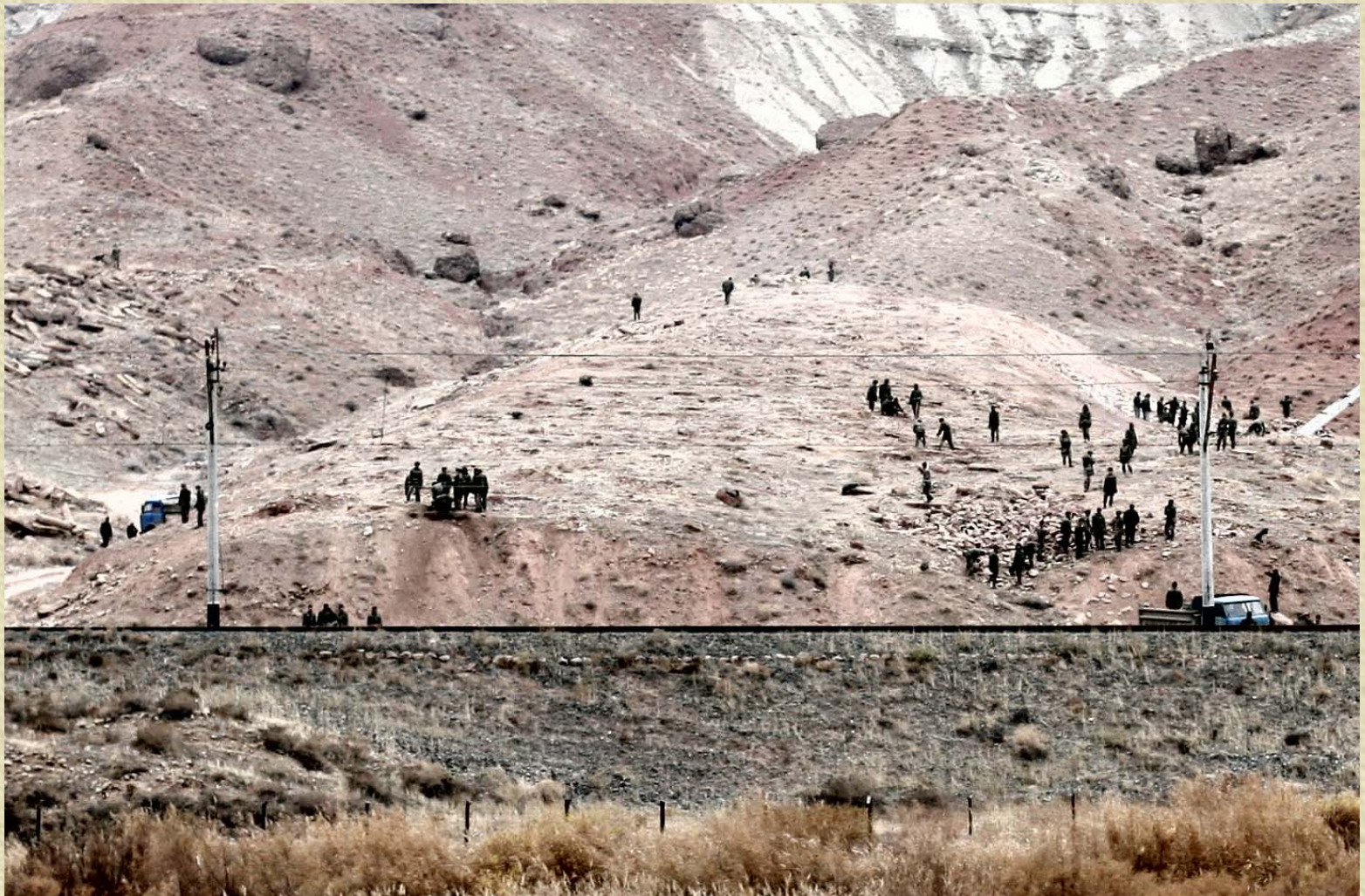
Soldiers removing remnants of the Djulfa Armenian cemetery graves.

Photo: Armenian Apostolic Church Diocesan Council, Tabriz, Iran – 12/2005