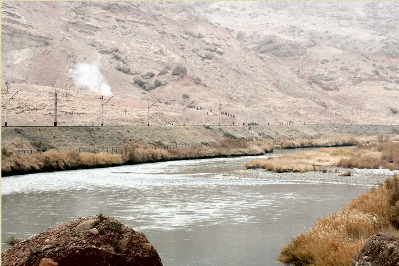
Photo: Armenian Apostolic Church Diocesan Council, Tabriz, Iran – 12/2005