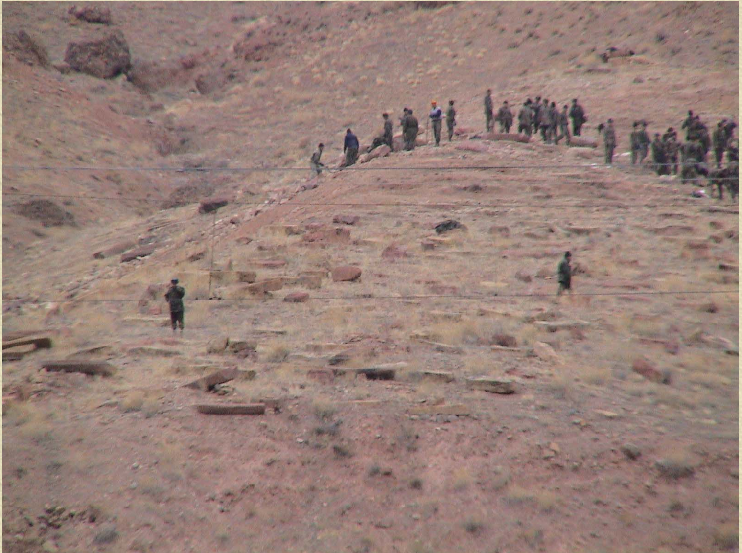
Photo: Armenian Apostolic Church Diocesan Council, Tabriz, Iran – 12/2005