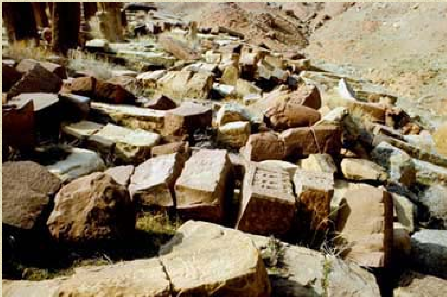
Armenian cemetery of Djulfa khatchkars in ruins.

Photo: Research on Armenian Architecture, 1998