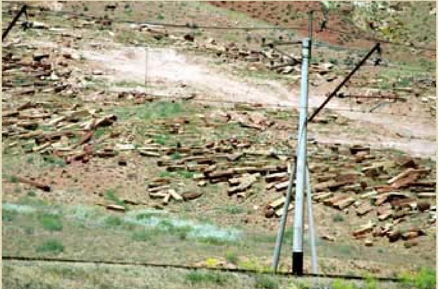
Armenian cemetery of Djulfa khatchkars in ruins.